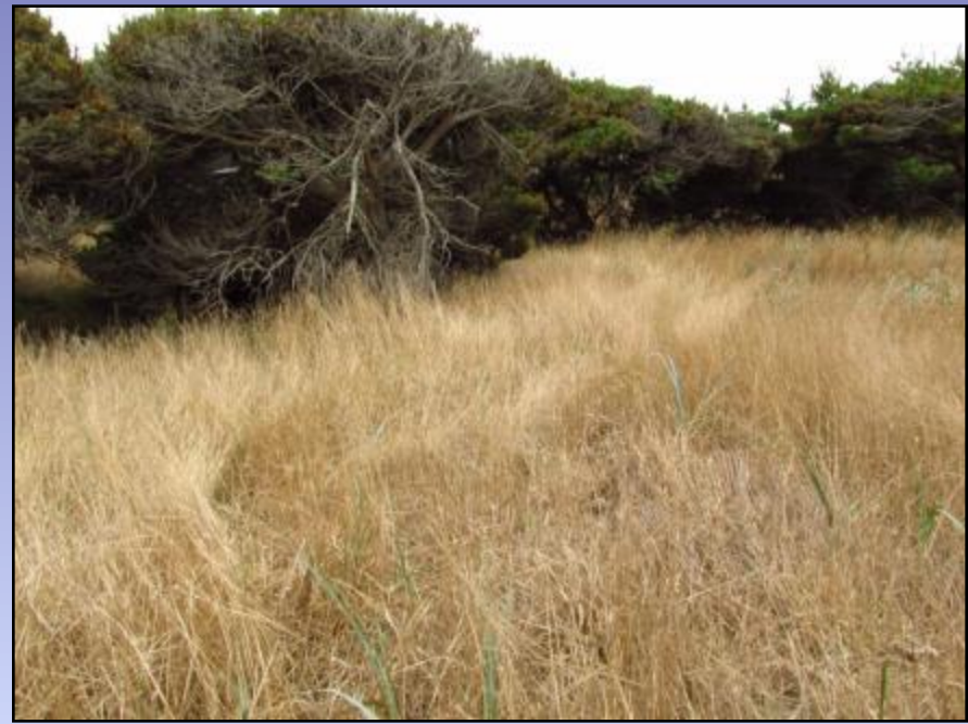
Rat's-tail Fescue, Vulpia myuros