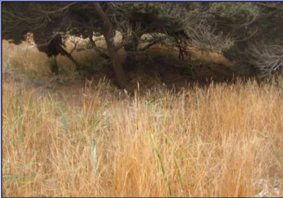
Silver Hairgrass, Aira caryophylla