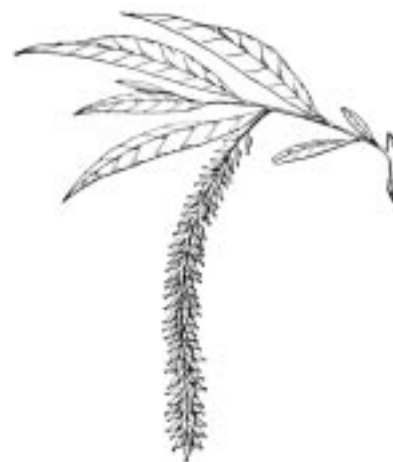
Willow leaf and seeds.