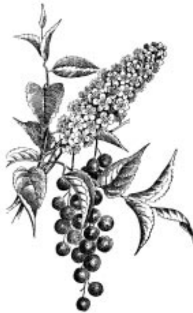
Flower and fruit of chokecherry, Prunus virginiana .

and shoot sprouting. Still other species, like the Pacific madrone, use both seed and budding from stumps to assure their survival. Some of these trees, such as red alder, can be found on disturbed ground in early successional forests and others only grow in the shade of other well-established trees. All of these species have their place in a well-functioning ecosystem.