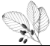
Table 2. Selected Native Hardwood Trees of Oregon and Washington