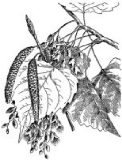
Leaves and seeds of cottonwood.

bare-rooted seedlings, larger transplant stock, layering, whips, and rooted cuttings. Many hardwoods, especially the most commercially important species, are easy to propagate and can be quite forgiving of technique. One advantage of using native species exclusively is that they are well adapted to the area and have site-appropriate methods of seed dispersal and regeneration that simplify propagation. Some hardwoods, such as madrone, have very low germination and survival rates when sown or planted. Seed or root stock can be acquired from many nurseries. More nurseries are now carrying native stock for purposes of landscaping, erosion control, and wildlife habitat development. Where permission is granted or on one's own land, native hardwoods free from insects and diseases can be dug up and used for bare rooted plantings; whips from several species such