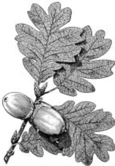
Leaves and acorns of white oak, Quercus garryana .

and small mammals. During hot summer months, the oaks provide shade and cover for many different animals and help keep water temperatures cool for trout and salmon. In the fall, leaves drop into the streams providing hiding cover for small fish. Fallen leaves on land provide thermal and hiding cover for amphibians and reptiles. Additionally, the floating leaves provide habitat for insects which in turn provide fish food. These hardwood trees can develop