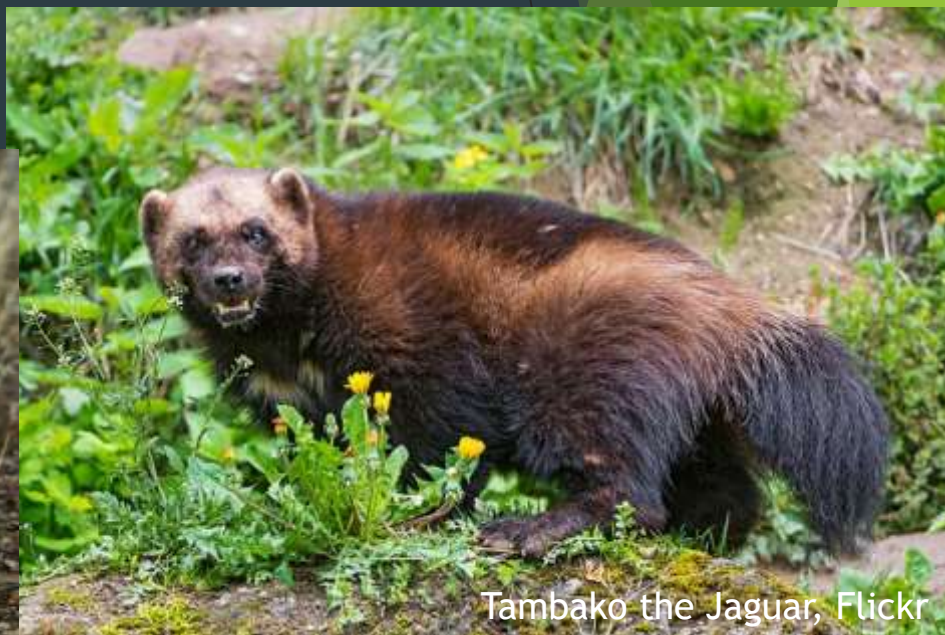
Tambako the Jaguar, Flickr