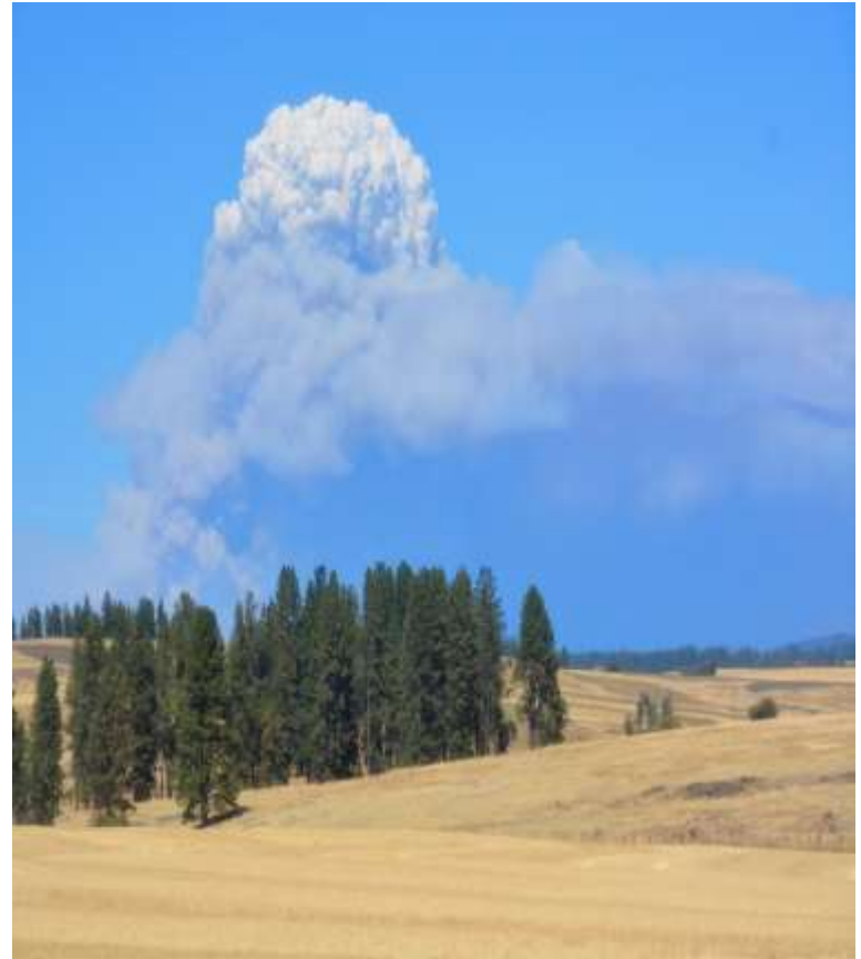
Grizzly Complex Fire, Oregon, August 20, 2015