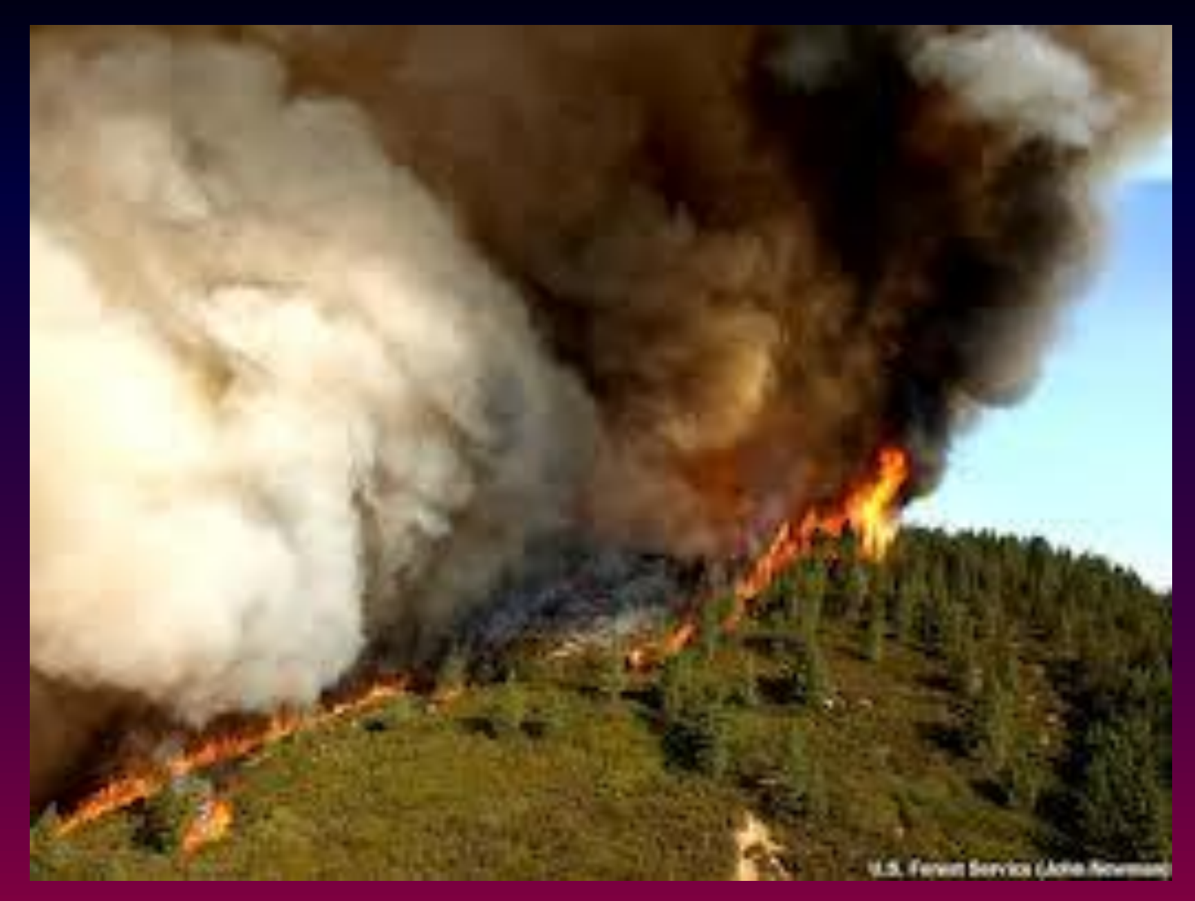
"Independent Action" Taking Matters into Your Own Hands