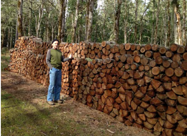
Trees that are too small or defective are still viable as firewood, whether for sale or for personal use.

even require more than the total value of the trees. It is important to remember that, in these smaller operations, better options may exist than selling to a local mill—the same volume of trees being considered for harvest would have a firewood value of over $1,000.