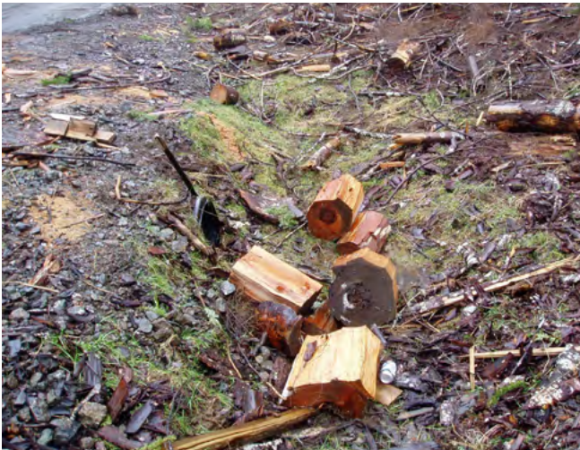
Decking logs near a road is common practice in logging operations. Special care needs to be taken to ensure the site is returned to its natural state after ending operations.

In large-volume logging operations, bigger landing sites (places where logs are processed and stored for hauling to the mill) are critical because of the space required to accommodate larger log decks and the variety of equipment that occupies a landing site, including yarders, shovels (log loaders), multiple processing systems, bulldozers, skidders, and log trucks in different combinations. Most small-volume operations involve only ground-based systems. A typical small-volume operation requires enough space to deck one or two loads of logs, the yarding system (normally a skidder and/or a bulldozer), and a self-loading log truck. Smaller landing sites are easier to locate and construct than larger ones simply because they require less space to process the timber.