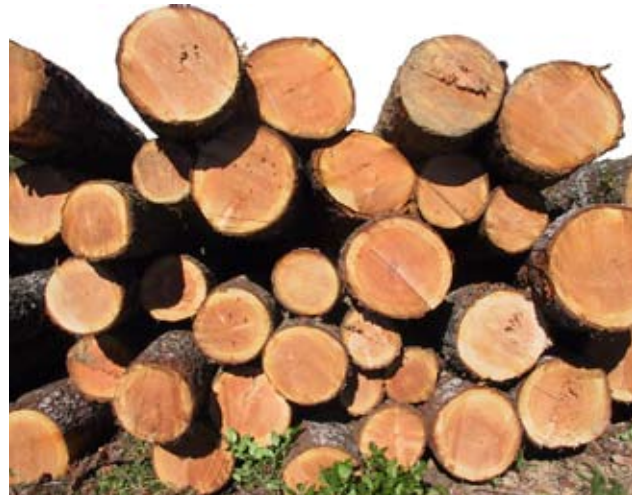
Figure 1.—The vast majority of timber harvests on private woodlands are log sales.

This publication provides a step-by-step overview of selling timber, along with references to other sources of information. The steps are derived from the experiences of landowners, consultants, loggers, and log buyers and are presented in the order they should be taken to ensure a successful