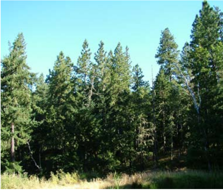
Figure 4.—In a stumpage (standing timber) sale, payment can be either in a lump sum or on a scale-out basis.

Similarly, they may lose value in the log-making process by not fully understanding mills' preferences for length, diameter, and quality.