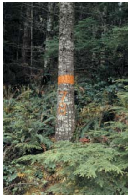
Figure 6.—Within a harvest area to be clearcut, mark the leave trees (for wildlife, if applicable, and for Oregon Forest Practice law requirements) to show loggers which trees must not be harvested.

The seller also is responsible for paying self-employment taxes, which can be costly, as well as the Oregon Forest Products Harvest Tax and potentially a severance tax, depending on the seller’s property tax program.