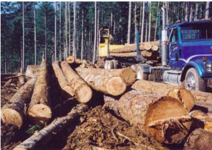
Figure 10.— If the operation is in western Oregon, remember that log branding is required before hauling begins.

EC 1582, Timber Harvesting Options for Woodland Owners , can help identify the method of logging most appropriate for a specific area.