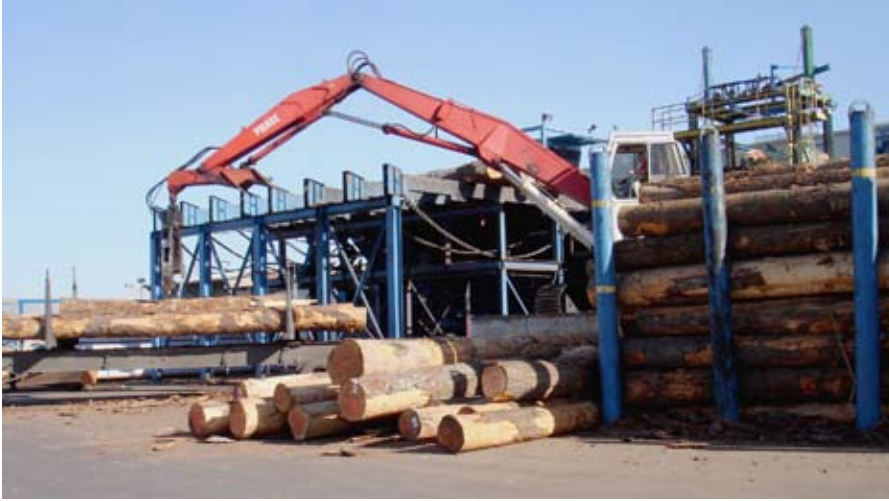
Figure 7.—Consider visiting the log yard of a mill that is on your list of prospective buyers. A visit is a good way to obtain insights and additional information regarding preferred lengths, diameters, and other characteristics of the logs the mill buys.