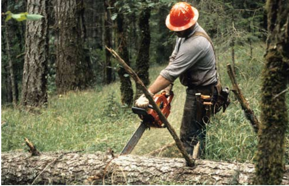
Figure 9.—The “right” logger is not always the one with the lowest bid. Choose the contractor you believe will best meet your overall objectives for log production, resource protection, and responsible business practices.

In either type of stumpage sale, be sure to carefully describe harvesting expectations in the contract.