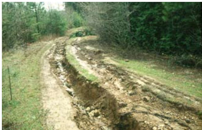
Figure 5.—Poor roads can limit your ability to take advantage of market opportunities.

A lump-sum sale sets a fixed price for all timber in the designated sale area. Whether the buyer removes a single tree or every tree in the designated area, the total price is the same. This sale type is attractive to some sellers because it shifts much of the