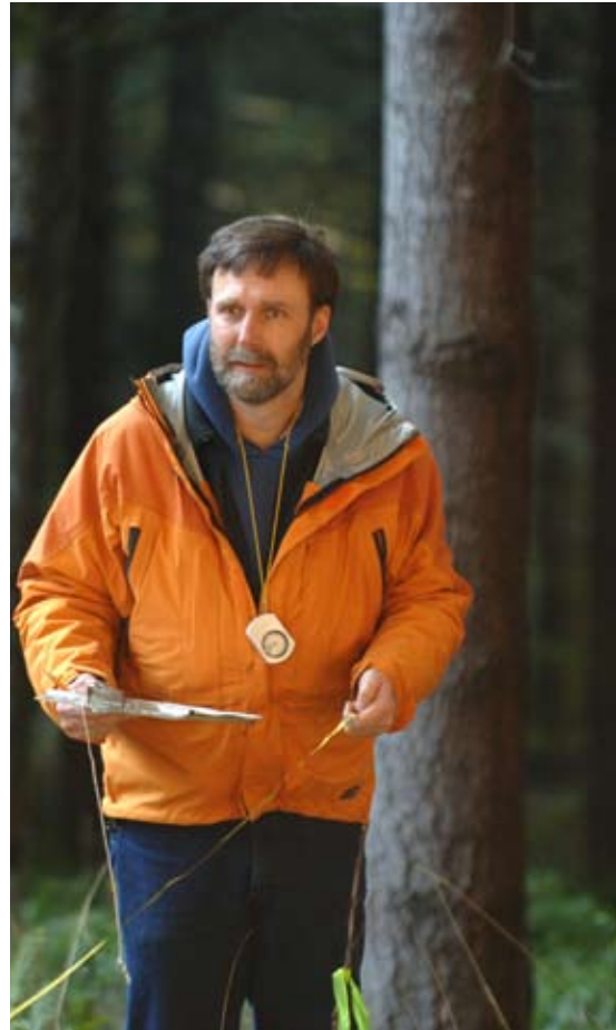
Figure 3.—A key to effective marketing is knowing what potential products you have in your forestland.

Friends and neighbors Friends and neighbors often are eager to give marketing advice gleaned from personal experience. They can help you get a feel for the way different ownership sizes, logging conditions, timber types, and other factors shape marketing strategies and experiences. Neighbors and friends also may have information on potential markets and pricing, and generally they are happy to share information and advice they found useful. However, be cautious about information from other landowners. Their experience may be limited to one or a few sales—and