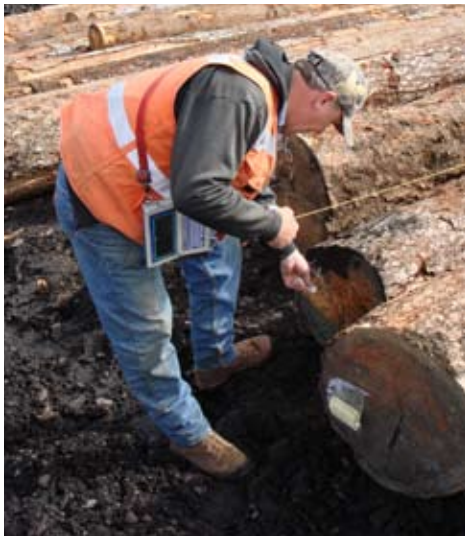
Figure 8.— In buyers' pricing structures, diameter breaks occur in various increments depending on species and mill type.

Log buyers structure their offers in a variety of ways; we will address the more common pricing structures.