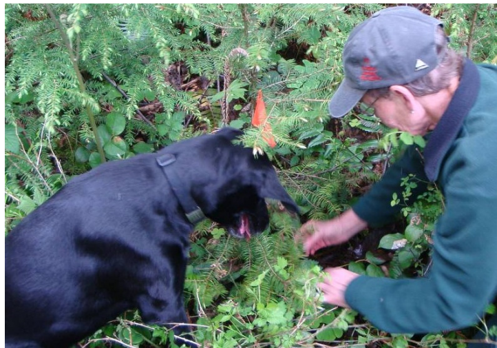
Photo 5. Dogs can be trained to help find truffles

raking you will inevitably dig up some immature truffles. Marketing very immature truffles can have a detrimental effect on the marketplace, since a chef without experience with Oregon truffles may have a suboptimal result when they unknowingly use an immature product. A chef or other end user not knowing what a mature Oregon truffle is supposed to feel, look, smell and taste like may think the immature truffle is as good as they get. Unlike many products where common sense might tell you that something is not yet ripe Oregon truffles can be more confusing, even to a professionally trained chef that has experience with