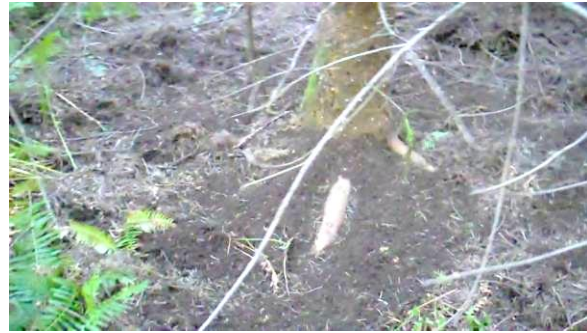
Photo 4a and 4b. Exposed tree roots after raking for truffles can damage trees

Photos 4a and 4b show results of a practice commonly referred to as “ringing a tree”, in which the harvester digs around all sides of a tree. This technique is destructive, as the roots are left exposed and may cause the host tree disease or death. Such practices have led many to condemn the use of raking entirely, but most good commercial harvesters take care to avoid destructive practices.