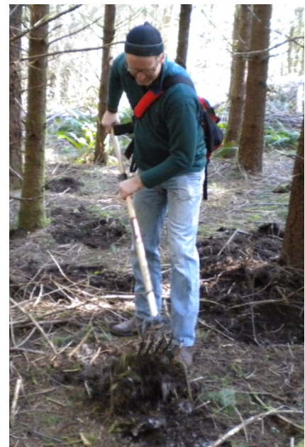
Photo 3. Raking for truffles

Raking is one method of uncovering truffles. Using this method, the harvester will gently rake the duff and litter at the base of the tree. This technique involves dragging the dirt slowly, and beginning to lift the rake half way through the stroke. The objective is to turn the soil upside down and spread it out evenly, if possible. Black truffles look like lumps of coal, and can easily be passed over as clumps of dirt by the uninitiated harvester. Care should be taken around tree roots, and all the soil, duff and litter should be replaced after digging. Any exposed tree roots should be covered with soil. Root rot and disease can befall a tree with exposed roots, and it is in the best interests of the harvester that the tree