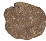
Photo 6. Cross section of Oregon white truffle