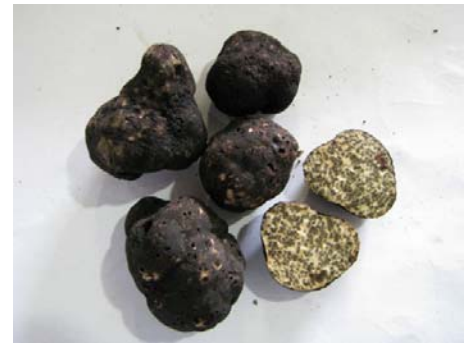
Photo 1. Oregon black truffles

grey, solid and firm, with grey pockets containing spores and surrounded by white veins. It looks marbled inside and slightly beige when ripe. Brown spots inside indicate decay. Black truffles are generally harvested sometime between September and February depending on the climatic conditions for that year. They are generally around the size of a golf ball, but can be as small as a dime and occasionally large ones as big as a baseball turn up.