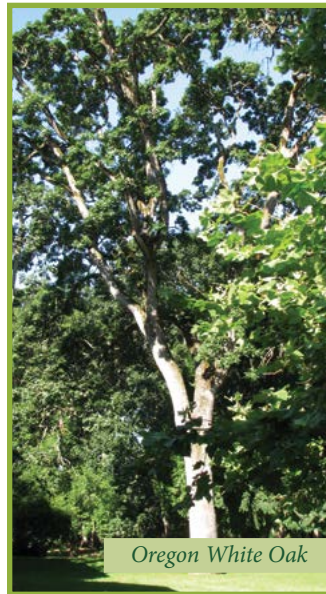
Oregon White Oak

Mature oaks need sun, but can grow up to 75 feet tall so be sure to plant them only in yards or landscapes with ample room to accommodate size. You can find Oregon white oak trees and seedlings at most reputable nurseries carrying native plants.